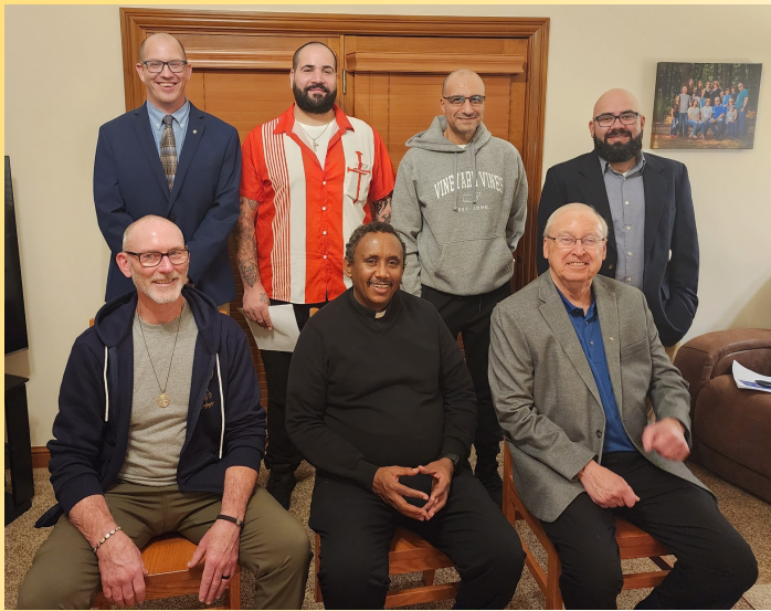
Welcome New Members